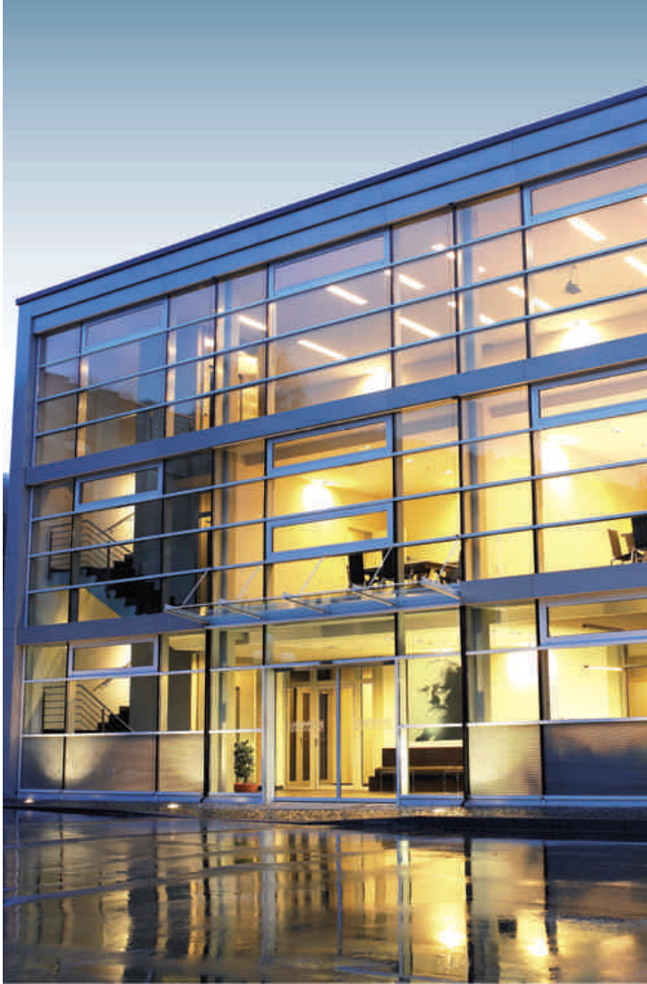
HOPPECKE company headquarters in Brilon, Germany