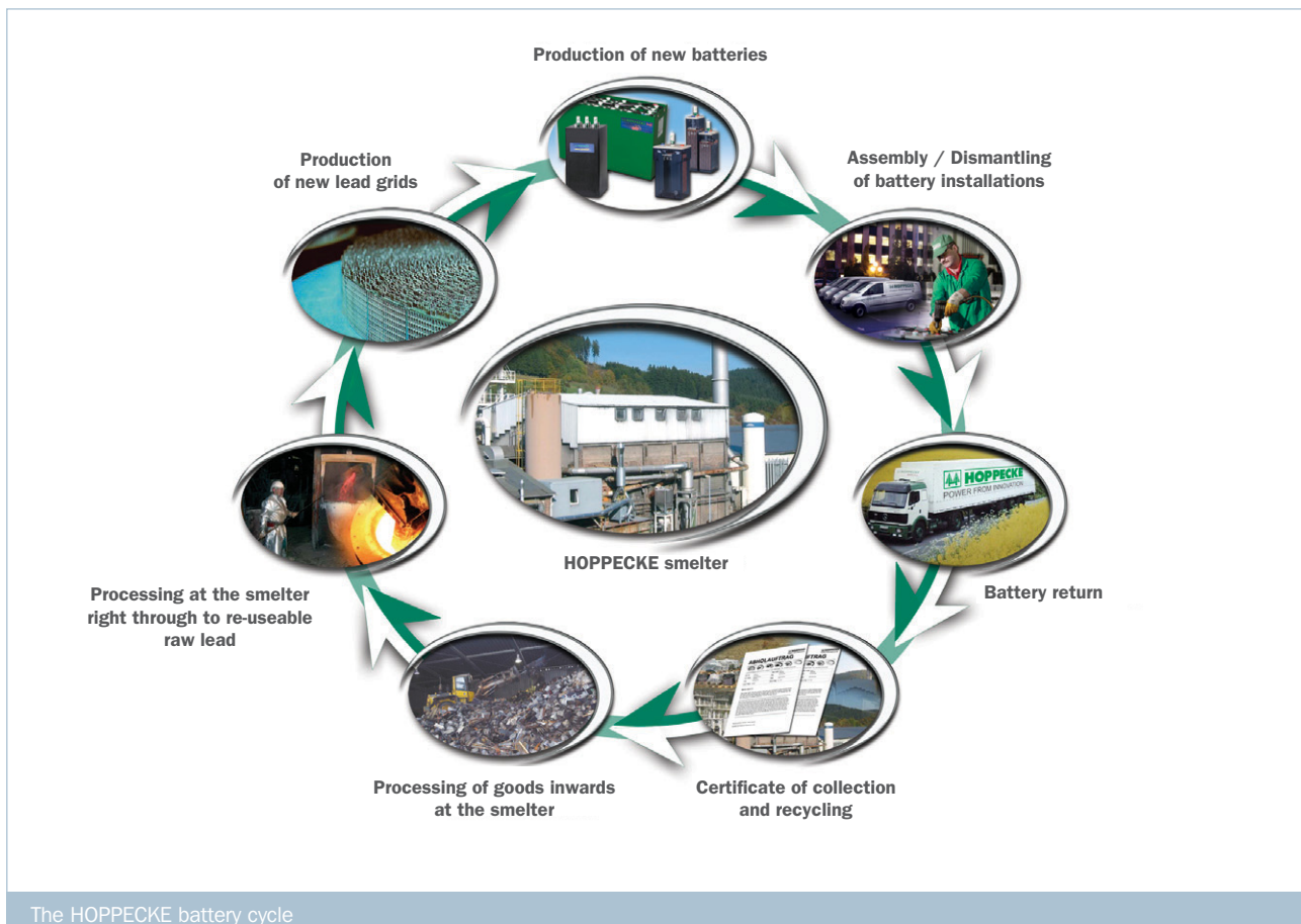
The HOPPECKE battery cycle