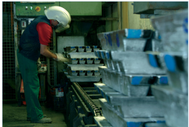
Casting workable raw lead