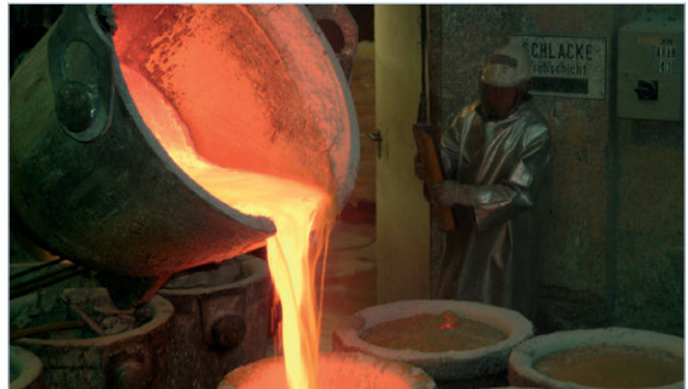
Filling ingot moulds with crude lead

The recovered metallic lead is refined, alloyed and cast into ingots, which are then fed back into the HOPPECKE production process. In this way we ensure careful handling of a scarce raw material which is utilised in an environmentally compatible economic cycle.