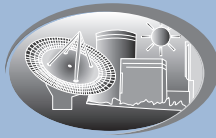
Reserve Power Systems