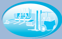
Motive Power Systems