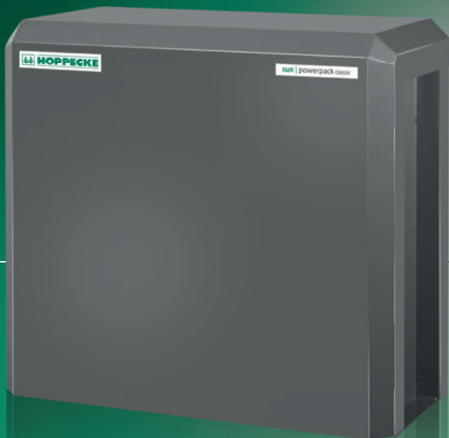
Similar to the illustration