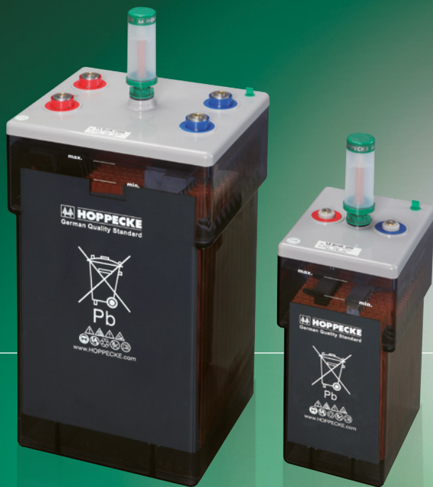
Similar to the illustration, AquaGen® optional