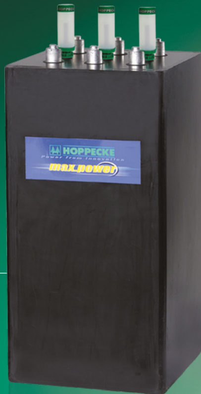
Similar to the illustration, AquaGen® optional